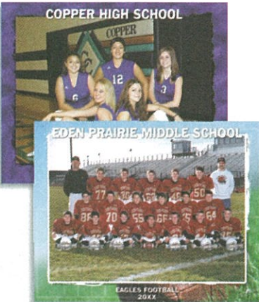
8x10 Bordered Team